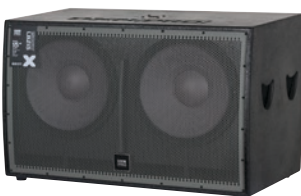
LB218 DXN PRO

Dual 18" Bass Bin RMS: 1000W Peak: 2000W Impedance: 4 Ohm Magnet: Y30, Ø250/150 Oz Voice Coil: 4" Add to PA Output: 1000W