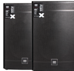
PLB15 DXN PRO

15" DJ/PA Speakers RMS: 2 x 600W Peak: 2 x 1200W Impedance: 8 Ohm Magnet: Ø190/95 Oz Voice Coil: 3" Tweeter: 1.75" Compression (AAA) Total Combo Output: 800W