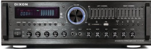
DIXON K2150USB INTEGRATED STEREO AMPLIFIER