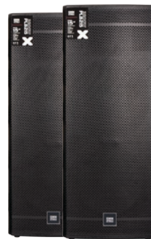
PLB215 DXN PRO

15" DJ/PA Speakers RMS: 2 x 600W Peak: 2 x 1200W Impedance: 8 Ohm Magnet: Ø190/95 Oz Voice Coil: 3" Tweeter: 1.75" Compression (AAA) Total Combo Output: 1000W