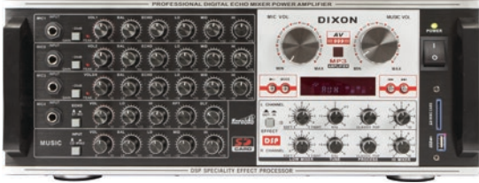
DIXON AV999 INTEGRATED STEREO AMPLIFIER