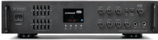
DIXON K2260USB INTEGRATED STEREO AMPLIFIER