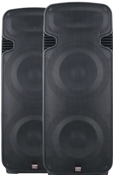
HYL-215 DXN PRO

Dual 15" DJ/PA Speakers RMS: 2 x 600W Packaging Peak: 2 x 1200W Impedance: 6 Ohm Magnet: Y30, Ø156/50 Oz Voice Coil: 2.5" Tweeter: 1.34" Compression Total Combo Output: 1100W