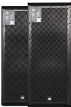
F215 DXN PRO

Dual 15" DJ/PA Speakers RMS: 2 x 700W Peak: 2 x 1400W Impedance: 4 Ohm Magnet: Y30, Ø170/60 Oz Voice Coil: 3" Tweeter: 1.75" Titanium Diaphragm Total Combo Output: 1700W