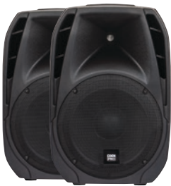
HYQ-15P DXN PRO

15" DJ/PA Speakers RMS: 2 x 450W Packaging Peak: 2 x 900W Impedance: 8 Ohm Magnet: Y30, Ø170/60 Oz Voice Coil: 3" Tweeter: 1.75" Titanium Diaphragm Total Combo Output: 800W