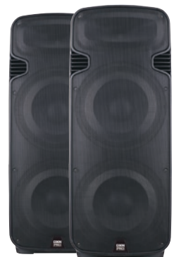
HYL-215 DXN PRO

Dual 15" DJ/PA Speakers RMS: 2 x 800W Peak: 2 x 1600W Impedance: 6 Ohm Magnet: Y30, Ø170/60 Oz Voice Coil: 4" Tweeter: 1.74" Compression Total Combo Output: 1350W