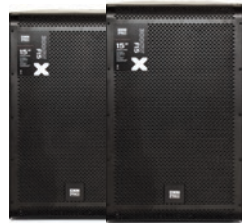
F15 DXN PRO

18" DJ/PA Speakers RMS: 2 x 450W Peak: 2 x 900W Impedance: 8 Ohm Magnet: 70 Oz Voice Coil: 3" Tweeter: 1.75" Titanium Diaphragm Total Combo Output: 1000W