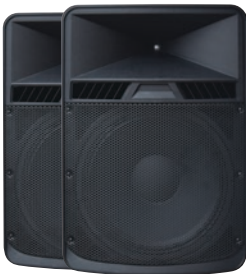
HYQ-18P DXN PRO

18" DJ/PA Speakers RMS: 2 x 450W Peak: 2 x 900W Impedance: 8 Ohm Magnet: 70 Oz Voice Coil: 3" Tweeter: 1.75" Titanium Diaphragm Total Combo Output: 1000W