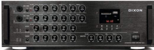
DIXON K2233 INTEGRATED STEREO AMPLIFIER