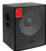
LB15 DXN PRO

Dual 15" DJ/PA Speakers RMS: 2 x 700W Peak: 2 x 1400W Impedance: 4 Ohm Magnet: Y30, Ø170/60 Oz Voice Coil: 3" Tweeter: 1.75" Titanium Diaphragm Total Combo Output: 1400W